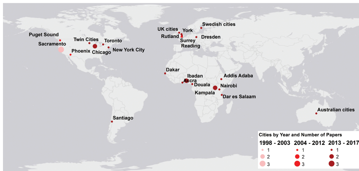
Figure 2. Study locations for articles on urban forests and resilience.