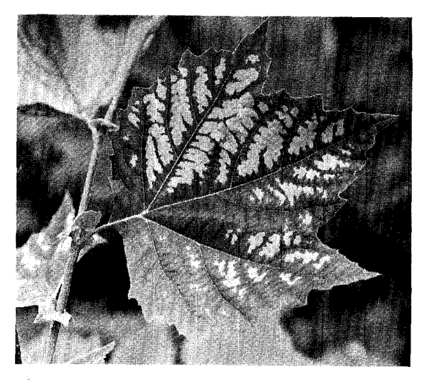
Figure 2. Sulfur dioxide injury in the form of interveinal necrosis on a 'Bloodgood' London planetree leaf. The injury occurred following an exposure to 1.00 ppm sulfur dioxide for 7\frac{1}{2} hours.

fected, relative age of leaves affected, injury patterns (i.e., interveinal, marginal, stipple, etc.), and injury color. The pollutants suspected of causing the injury are noted, as well as insect, disease, or other stress factors that might be contributing to the injury. This field test will last a minimum of 3 years for each cultivar tested.