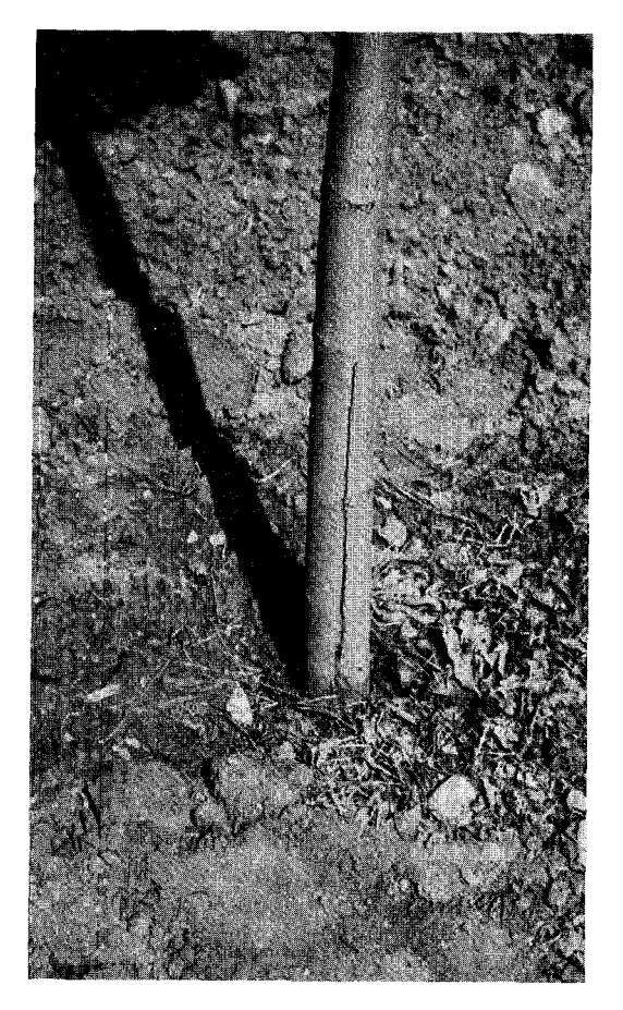
Figure 1. Frost crack on Acer platanoides cv. 'Emerald Queen', May, 1972.

In general our observations agree with those of French and Fuhs (1) with respect to size and location of the cracks. However, they reported that 'Emerald Queen' was the most resistant of eight varieties of Norway maple while we found it to be the most susceptible. Our results also agreed with earlier reports (2,3) that trees growing in poorly drained sites are more subject to cracking than are those growing in drier, better drained soils. But, our results do not support the recommendation (3) that young trees can be protected by covering their trunks with tree wrap in late fall. Additional research is needed in other areas under a variety of conditions to determine the effectiveness of tree wrap.