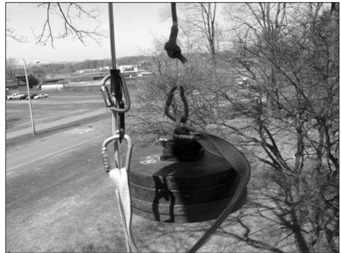
Figure 1. Drop mass (right) and lanyard connected to the ascender (left) and suspended by the short piece of throwline (attached to a larger diameter rope) prior to free fall.

A figure-eight loop was tied in each rope that was tested and connected with an ISC steel D-shaped carabiner (70 kN breaking strength) to a dynamometer (Dillon EDXtreme 11 kN capacity, accurate to 1 N, recording at 60 Hz). A second ISC steel D-shaped carabiner was used to hang the dynamometer from a steel eyebolt 16 mm in diameter that was secured in a branch approximately 12 m above the ground in a red oak ( Quercus rubra ). The branch was 265 mm in diameter at the point where the eye bolt was installed, 304 mm in diameter where it attached to the trunk, and oriented 65 degrees from vertical. The eye bolt was inserted through the branch 1524 mm from the point of attachment. A separate rope was hung on the branch 1798 mm from the attachment to hold the drop mass with a short piece of throwline (4 mm in diameter)