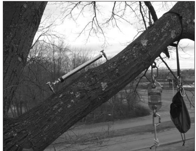
Figure 2. Branch showing, from left to right, strain meter (on top of branch), dynamometer and rope hung from eye bolt, and gear bag indicating location of rope from which drop mass was suspended prior to free falling and loading ascender.

prior to releasing it to load the ascender. The horizontal distance between the eye bolt and the drop mass was 225 mm (Figure 2).