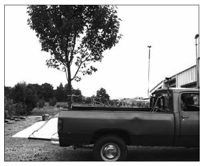
Figure 2. A tree secured to the sled in the bed of the pickup truck. The anemometers are visible in the front of the bed. The distance from the bottom to the top of the taller anemometer represents 2.4 m (7.9 ft).

that range to determine acceleration. Vehicular acceleration was multiplied by air density (1.226 \text{ kg/m}^3 [0.077 \text{ lb/ft}^3]) and estimated crown volume to determine the force resulting from vehicular acceleration. Crown volume (V) was estimated using measured still-air crown dimensions (height [h] and width normal to vehicle direction [w]) and the formula for the volume of an egg (Narushin 2005), which visually approximated most crowns,