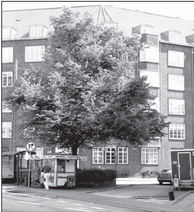
Figure 2. Tilia cordata located in central Copenhagen. Value according to VAT03 is US$7,600.

The tree is located on a residential street with limited traffic. Aesthetically, it is questionable whether the tree contributes in a positive way because it once was one of several trees on a row, but now it is one of very few old and intensively pruned trees, giving the street a poor impression. The Location Factor is estimated to be 1.20.