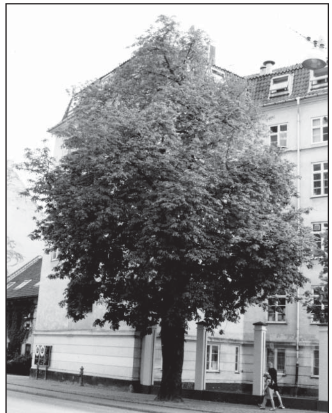
Figure 3. Aesculus hippocastanum located just outside central Copenhagen. Value according to VAT03 is US$8,900.

In Table 4, two central factors used in the CTLA method (2000) are incorporated into the new Danish model in order to show the differences in total value using different factors.