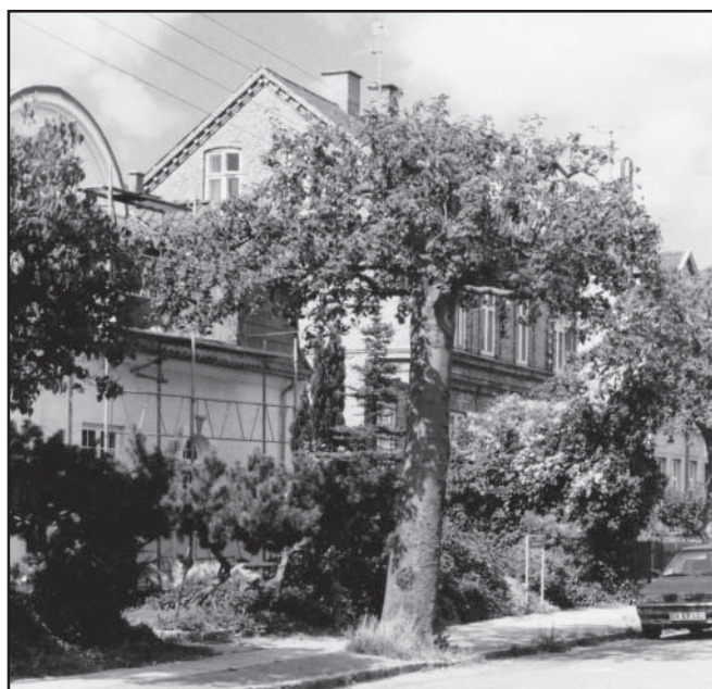
Figure 4. Sorbus intermedia located just outside central Copenhagen. Value according to VAT03 is US$1,100.

The value of three individual trees would increase 1.9 to 3.6 times using trunk area instead of circumference, and 4.2 to 9.3 times if the largest available tree was used instead of a fixed size of 18 to 20 (7.2 to 8 in.) cm circumference at 100 cm (40 in.) above ground. The prices shown for large trees in Table 4 could be even higher if trees were imported from Germany or The Netherlands.