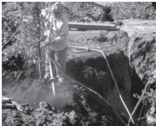
Figure 1. After 4 years, root systems of coast live oak were fully excavated using a pneumatic excavation tool (Air-Spade®), backhoe, and jackhammer.

Following excavation, intact root systems were removed from the field, suspended from a greenhouse roof beam, and