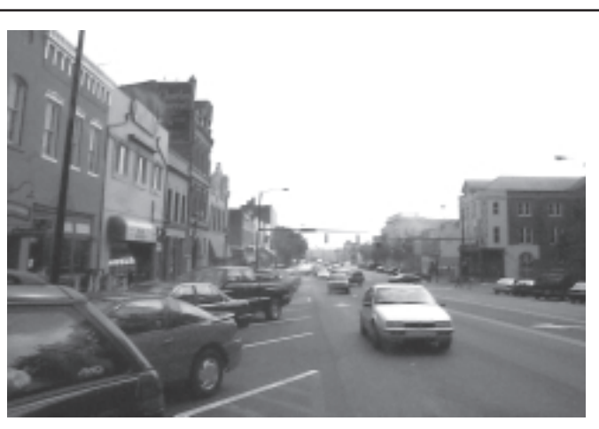
load .736 - mean 1.81, sd 0.98