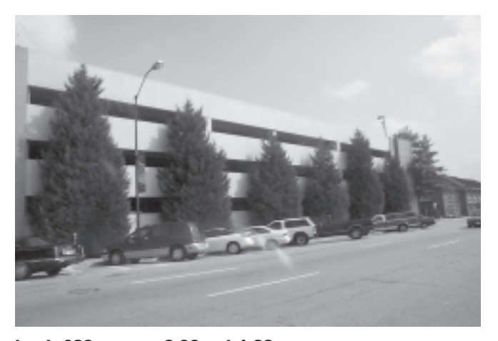
load .628 - mean 2.93, sd 1.22 Category 2: Buffered Buildings, mean 3.13, sd 1.00