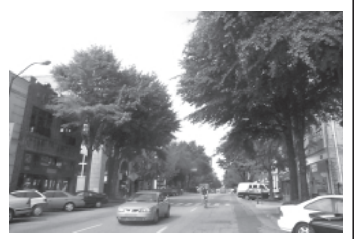
load .702 - mean 4.17, sd 0.86