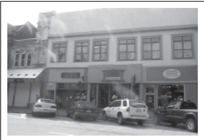
load .773 - mean 2.19, sd 1.08 Category 1: Dominant Buildings, mean 1.98, sd 0.71