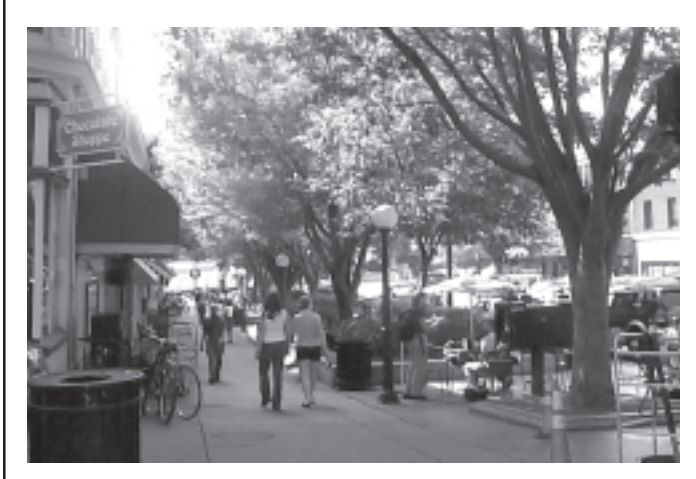
load .761 - mean 4.67 (high), sd 0.66 Category 3: Green Streets, mean 4.00, sd 0.60