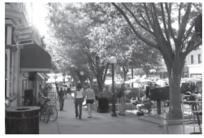
P12 - (high) mean 4.67, sd 0.66