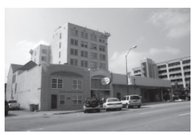
P4 - (low) mean 1.34, sd 0.73