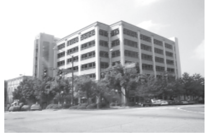
load .604 - mean 3.34, sd 1.11