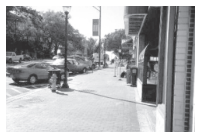
P19 - (median) mean 3.02, sd 1.14