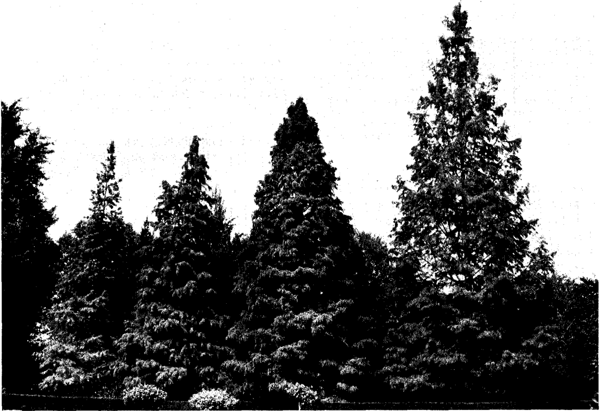
Taxodium distichum , swamp cypress. Specific variation is clearly demonstrated by this seed-raised group of T. distichum . This vigorous, formal, deciduous conifer makes an ideal specimen landscape subject, especially suitable for city plantings.

Demonstration Center. The latter will serve an increasing demand for both theoretical and practical horticultural education.