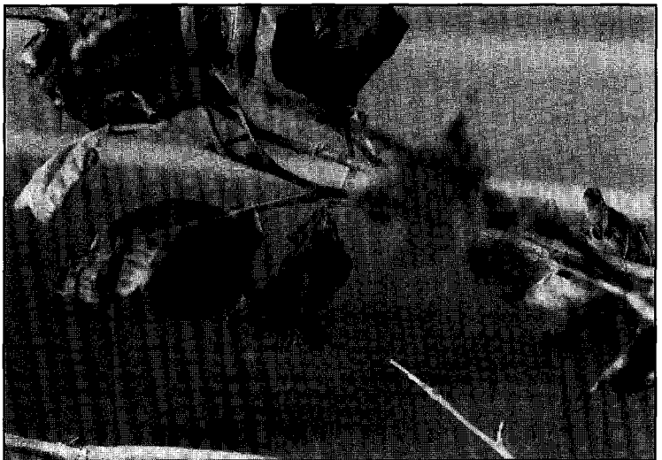
Figure 1. Saltwater spray desiccation of leaf margin and tip on London planetree growing along Atlantic Avenue.

A general crown thinning may occur as salt buildup in the soil causes soil structure destruction and root damage. In addition, trees may be deformed or misshapen due to greater damage on the