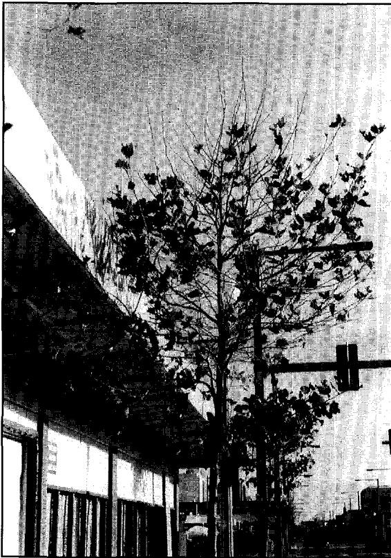
Figure 2. Saltwater spray defoliation of tops of London planetrees along Atlantic Avenue where tree heights exceeded protective building heights.

side facing the wind, or where trees stand taller than partially protective buildings (Figure 2). A damage gradient is often obvious with trees showing less injury the farther they are from the saltwater source (Figure 3).