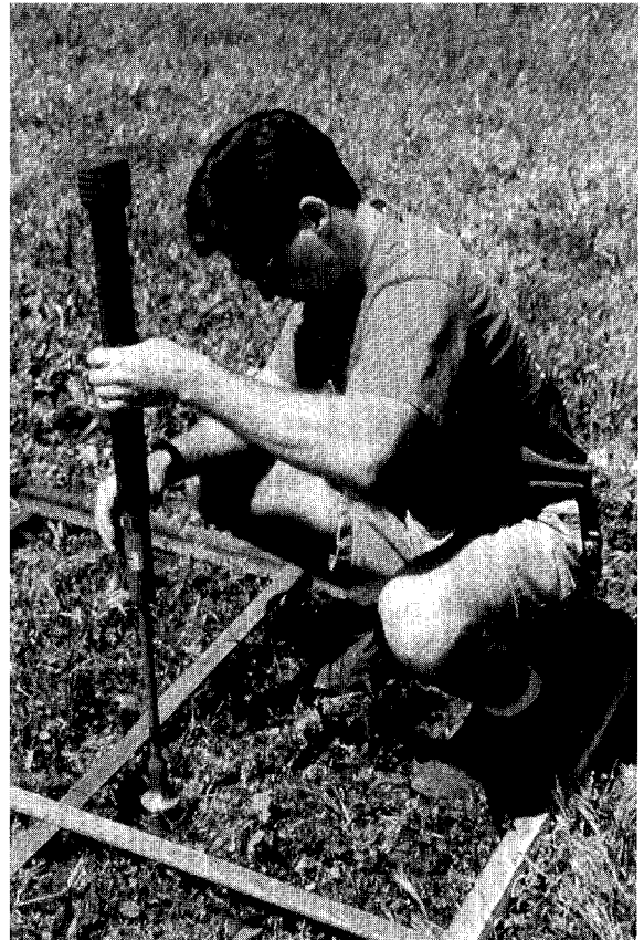
Figure 1. Driving the core sampler into the soil.

Core sampling is the most common technique for measuring bulk density in agricultural soils. A field core sampling tool (described in 3) is used wherein a cylinder is driven into the soil (Fig. 1) and a sample of known volume is extracted, dried and weighed. The dry weight of the soil is then