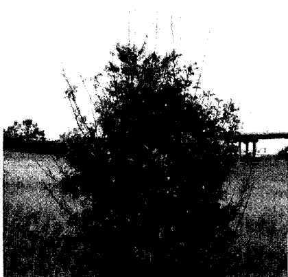
Figure 3. Crabapple showing extensive tip dieback.

Plant injury was evident as far as 150 to 200' from the highway's edge along Chicago free-ways. Langille reported Na was significantly increased to distances of 50 feet from the highway's edge after one salting season while soil Cl was increased to a distance of 200 feet. Sodium and Cl significantly increased to distances of 200 feet in Tsuga canadensis (L.) Carr, Canadian hemlock, needles after one winter. Williams and Moser (31) have shown that regardless of the rate of deposition, plants will be injured if exposure time is sufficient and that uptake of Na and Cl is linear with time (Figure 3). When tissue Cl levels reached approximately 2.7 percent, visual injury was manifested. Their work indicated that whether plants receive salts in low levels or high levels they will exhibit injury symptoms when the tissue Na or Cl concentrations reach a threshold level.