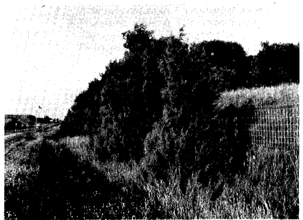
Figure 4. Eastern redcedar approximately thirty feet from the highway edge exhibiting dieback and one-sided habit.

Sodium and Cl accumulate in different amounts in various species (Table 2). The visual injury and degree of salt tolerance correlated closely with the shoot Cl levels. Hedera was more salt tolerant than Viburnum > Pyracantha > Coleus > Cercis . Chloride levels which induce toxicity symptoms in plants are difficult to compare because of the conditions under which the plants were grown and the tissues sampled. Tissue Na and Cl