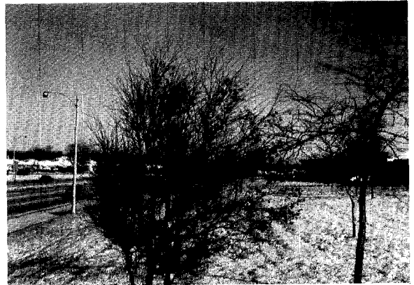
Figure 1. Hawthorn showing typical one-sided effect due to aerial deicing salts. Note fruit on the side away from the highway and the extensive "brooming" on the side closest.