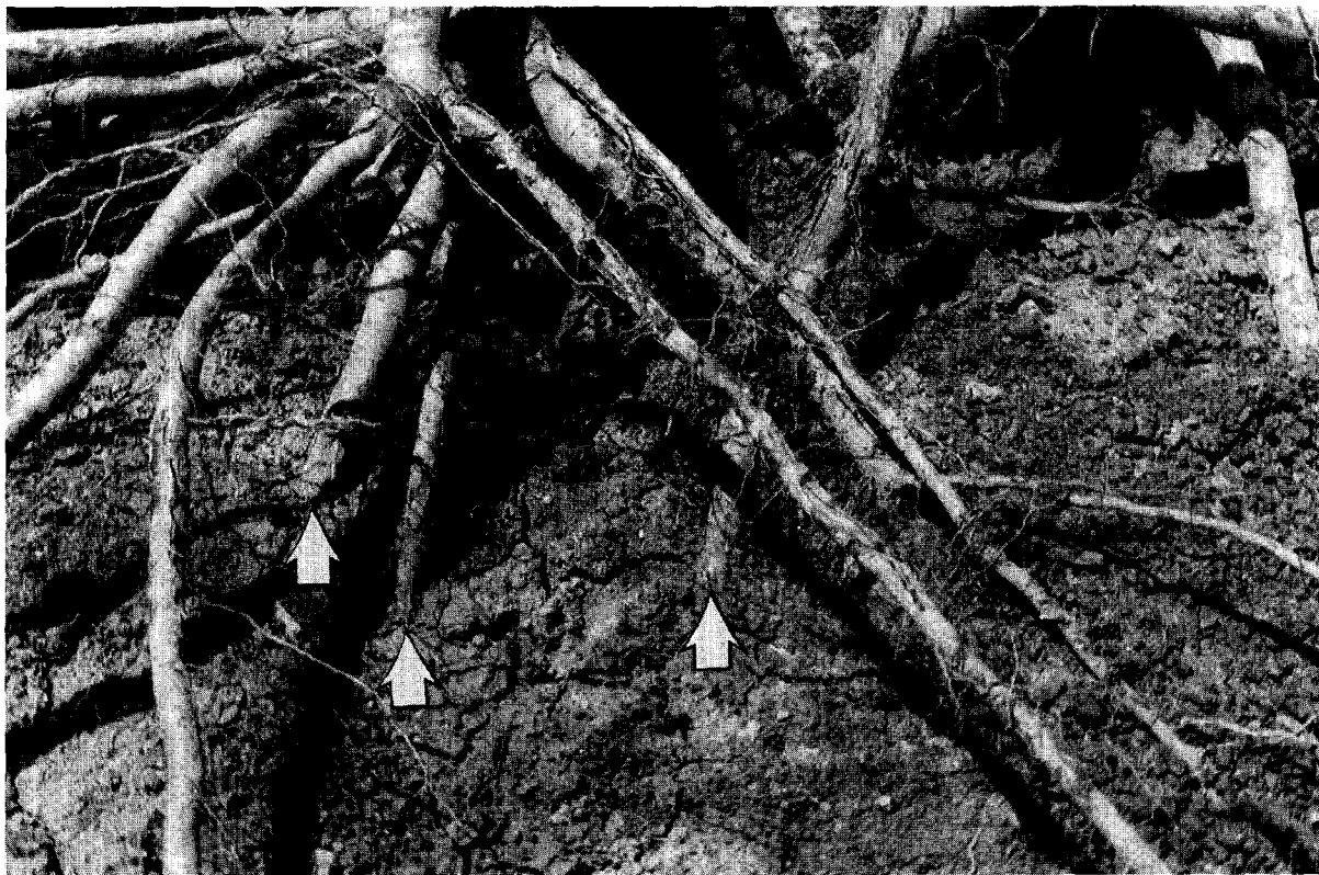
Figure 2. Roots grew readily from the backfill soil into the compacted site-soil without any apparent interface restriction.

There were no significant differences among treatments for any column using Newman-Keuls test for analysis of mean separation at the 5 percent level.