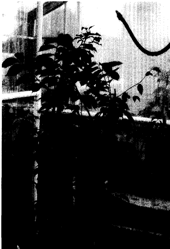
Figure 2. Elms being treated with simulated acid rain.

fewer eggs per ovipositing female on acid rain treated foliage (Figure 5). This difference was quite evident under charcoal filtered conditions alone. However, there were no differences in preoviposition period. Significant interactions among hybrids, fumigants, and acid rain