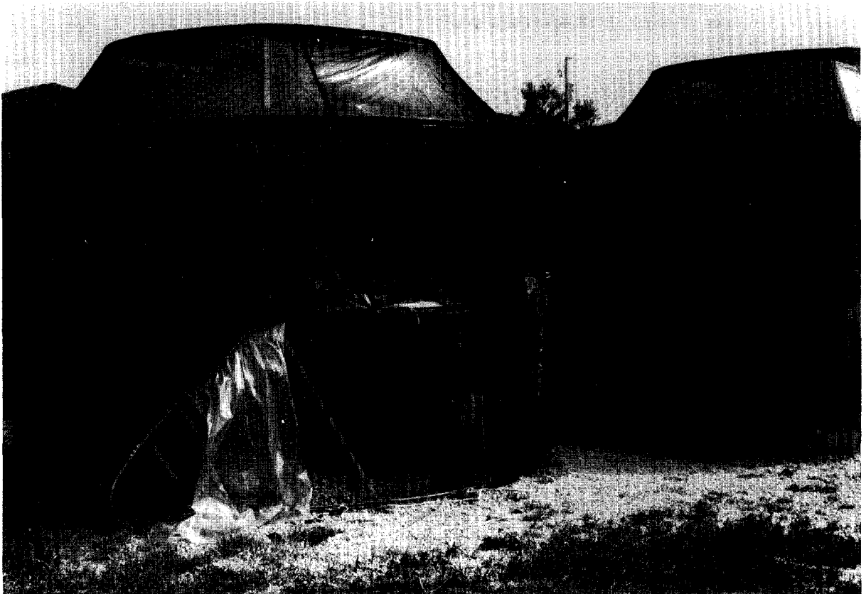
Figure 1. Open-top chambers used to fumigate elms.

ELB were field collected from Ulmus procera Salisbury as wandering third instars and were held in the laboratory at 25°C at 15:9 (1:d) for pupation and adult emergence. Pairs (male plus female) of newly enclosed, unfed, adult ELB were randomly assigned to plastic petri dishes containing foliage subjected to a given treatment combination (Figure 3). Fifteen pairs of beetles were used with each treatment. Leaves in petri dishes were replaced every 2 to 3 days. Dishes were examined daily to determine mortality, onset of oviposi-