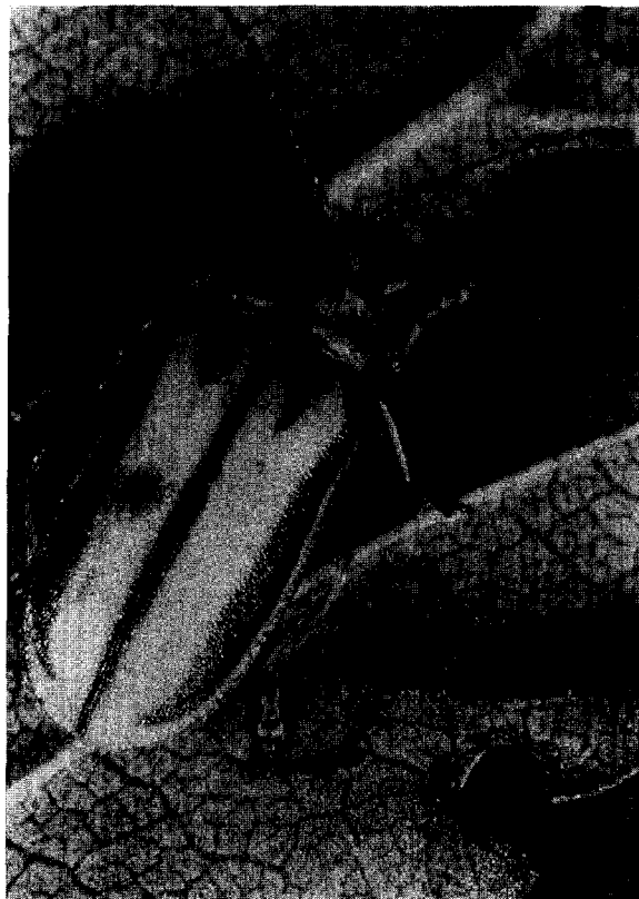
Figure 3. Adult elm leaf beetle used to bioassay for effects of atmospheric deposition on elm suitability.