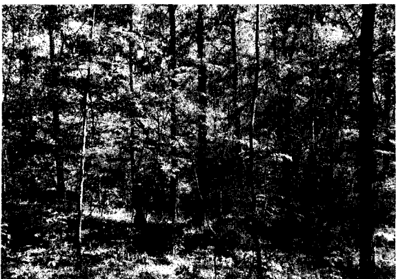
Figure 2. The participant's view at the completely wooded testing site. In such sites traffic and other mechanical sounds have strong detrimental impacts, while natural sounds are enhancing. Similar results obtained for residential and urban park settings, where sounds of children and pets are more tolerated as well.

judge sounds heard there, and so the sounds are not found to be as loud. Conversely, the expectation that wooded areas will be quiet leads people to use more stringent criteria to evaluate sounds heard there, and the same sounds are judged louder.