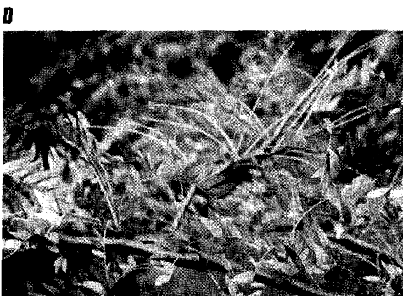
Figure 1. A. and B. Field shots of Gleditsia triacanthos inermis 'Majestic' ( O_3 resistant). Compare with C. and D. Field shots of 'Imperial' ( O_3 sensitive). Note upper leaf surface stipple and leaf drop on 'Imperial.' A. and C. were taken on August 17, 1983 and B. and D. on September 14, 1983.