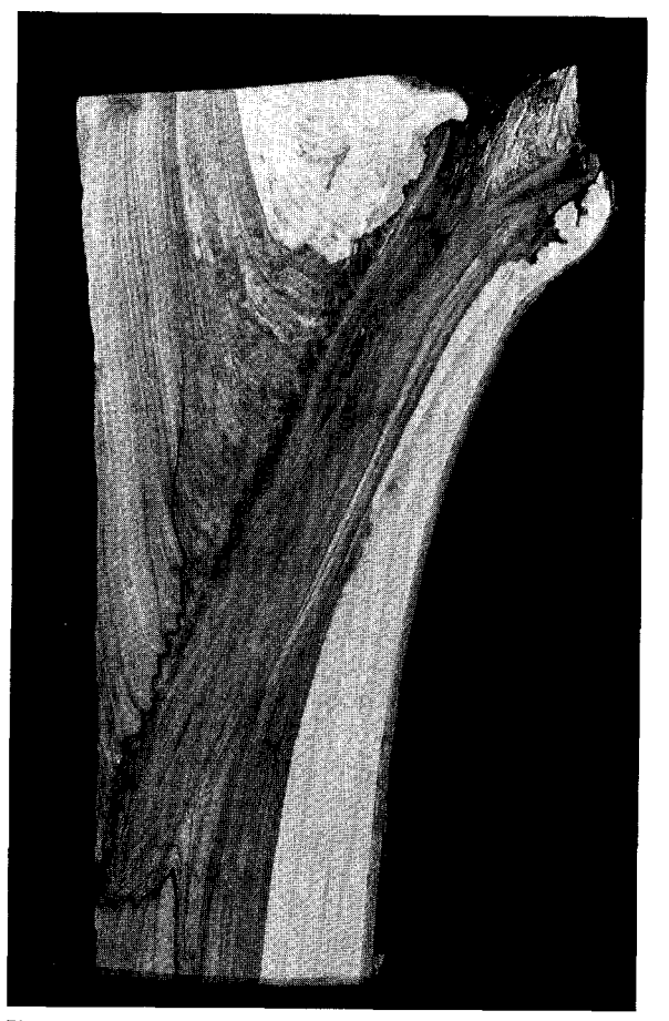
Figure 1. — Dissection of a poorly healed large branch stub on a paper birch. Poorly healed stubs are major external indicators of decay.

Before considering the steps for wound treatment, consider first the healing history of the tree by observing old mechanical wounds and old branch stubs and pruning cuts. A tree that has healed old branch wounds rapidly will usually heal new wounds rapidly. The opposite is also true.