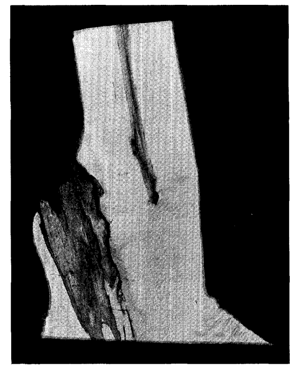
Figure 2.—Dissection of a maple with a dead basal sprout. The decay in the sprout stub was compartmentalized, and it did not spread into the main trunk.

When thinning young trees, use branchstub healing as an indicator of healing potential. Select for removal those young trees that have poorly healed stubs.