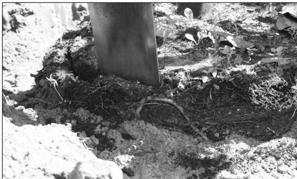
Figure 1. Shaving the root ball at planting (note root pruning spade cutting roots from outer 4 to 5 cm of root ball) after backfill was added to the planting hole. Removed roots and substrate were left in place as shown. Trunk is visible at top of photo, to the right of the pruning spade.

Water was added to settle backfill soil, and soil was tamped lightly by foot to standardize compaction. No berm or water ring was constructed around the root balls. Trees were mulched in a 1.6 m wide strip up to the trunk along each row immediately after planting with a mixture of aged wood chips, bark, and leaves from a local line-clearance contractor, which is common in many North American landscapes. Trees that were planted high were mulched with 5 cm on the root ball and 10 cm outside the ball; in addition to the 10 cm of soil, those planted deeply had 10 cm mulch over the ball and outside the ball. Vegetation between rows was mowed periodically; weeds in mulch were kept in check with three or four annual applications of glyphosate (isopropylamine salt, 41%). Trees were irrigated daily through three Roberts Spot-Spitters (Roberts Irrigation Products, Inc., San Marcos, Idaho, U.S.) positioned at the edge of the root ball directed toward the trunk. Thirty liters of irrigation were applied daily through 2008 and then