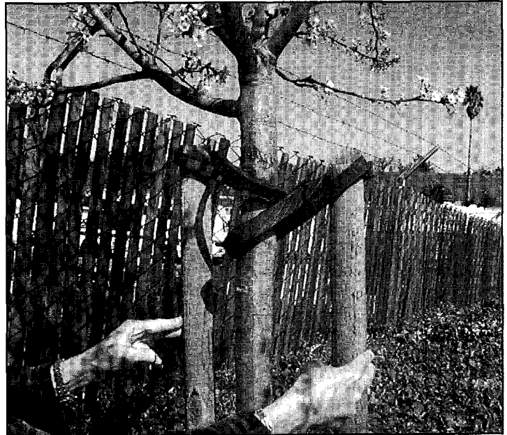
Figure 6. Slight lateral pressure with fingers moved (bent) stakes more than 15 cm (6 in.) after 1 year of continuous stem and crown movement by wind. This photograph demonstrates that even "rigid" double stakes stiffened with 2 ties to the stem could only partially oppose sideways stem deflection after 1 year.

The BT-supported stems, which were observed to sway in the wind more freely than those of TS or DS trees (as demonstrated in Figure 2), had the greatest stem taper. Prevention of stem swaying of Pinus taeda reduced stem taper (Burton and Smith 1972). The BT-supported Pyrus trees retained highest taper even after the supports were removed and all trees swayed normally. Interestingly, after the stem supports were removed, stem taper of DS-trees increased most (Table 1), as would be expected.