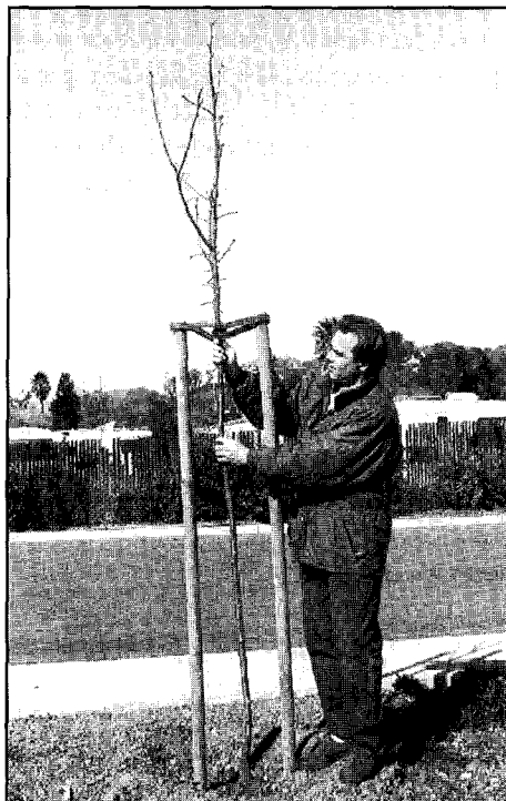
Figure 1. Double-stake (DS) support system.

This paper compares the effects of a commonly used double-stake stem support system with 2 new designs, Bio-Tie (Vitech Technologies, Inc.) and Tree Saver™ (Lawson & Lawson, Inc.), on the growth of Pyrus calleryana after replanting from 57-L (15-gal) containers into California landscape conditions. Because these trees were unable to stand upright without the stake support, the objective of this study was to evaluate the effect of these methods on shoot and caliper growth.