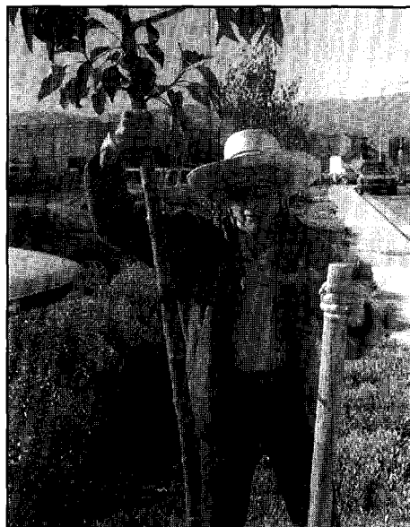
Figure 2. Bio-Tie (BT) support provided freedom for stems to sway in the wind.

Over a 3-year period (February 10, 1994, to February 13, 1997) a Pentax stick was used to measure tree height and height to the first lateral branch; stem diameter was measured at 3 stem locations: 30 cm (1 ft) above the ground (bottom diameter), 30 cm below the lowest lateral branch (top diameter), and midway between (center diameter). Stem diameter measurements were made with a microcaliper at 2 right-angle directions. Mean diameters were calculated for the 3 stem positions. Stem taper was calculated by subtracting the top diameter (cm) from the bottom diameter