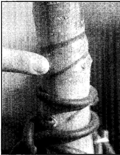
Figure 4. Injury to tree stem by Tree Saver Tree Anchoring straps. Stems of soft-wooded species might be girdled and perhaps affected in their growth when exposed to windy conditions, such as these were.

from northeast, northwest, southwest, east, and southeast directions. Therefore, the deflection of stems by wind was 2-directional, which may have affected not only growth in height and stem diameter, but also stem taper. The degree of stem deflection by wind depended on wind speed, resistance of the stem supports, and the season. The experimental site was visited more than 90 times when high winds were forecast, to observe the performance of supports when crowns and stems swayed in the wind. Lateral movement of crowns and stems during the growing season began when the wind speed reached approximately 2.5 m/sec [8 ft], and such wind speeds developed in 68 days (Figure 5). In contrast, wind speeds of the same velocity barely moved the crowns and stems of leafless trees.