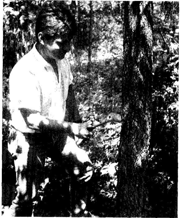
Figure 1. The FIC™ showing difficulty of application in dense stands.

Each of the capsules contained 0.16 grams of