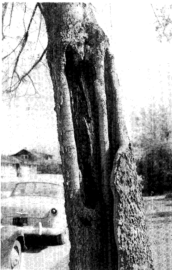
Fig. 1. An adventitious root developing from callus tissue at the top of this long cavity in a hackberry grew straight downward through the tree's rotting interior, made its way to the ground, and there took root to serve as a living post. (Austin, Texas)