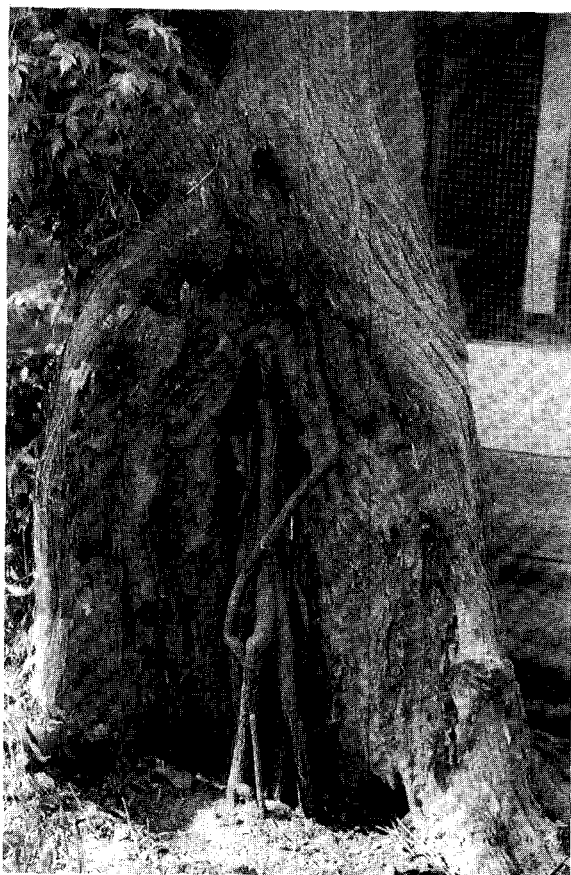
Fig. 2. This basally damaged Chinaberry managed to produce numerous adventitious roots from the callus tissue forming around the rim of the cavity. These roots made it to the ground just in time to become new supports for the tree which was in imminent danger of toppling. (Austin, Texas)