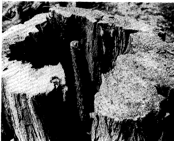
Fig. 4. The same thing closer to ground level, one of the new stems having been cast aside for greater photographic clarity.