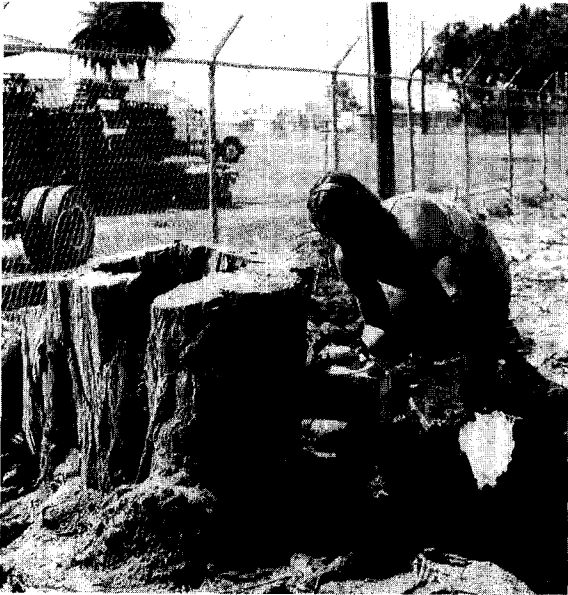
Fig. 5. The same tree being cut near ground level.

called to the banyans (and the Clusias ) whose multiple aerial roots do come to function as stems, and very successfully, the original trunk often disappearing entirely. Although the interior structure of young root and young stem are quite different, these differences disappear with the beginning of secondary growth. Macroscopically, older root and stem are hardly distinguishable,