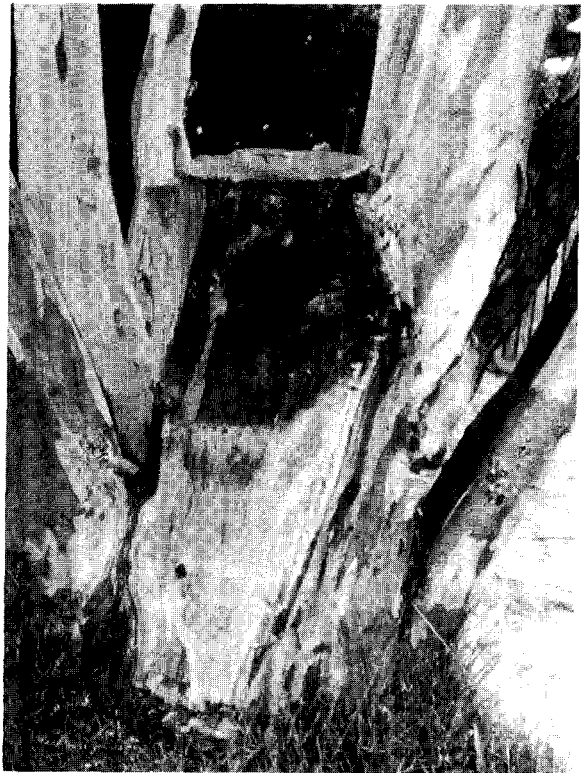
Figure 1. Poorly attached epicormic shoots of Eucalyptus cladocalyx can easily fall causing serious damage or injury.

Pruning Practices. Proper pruning practices have long been the topic of horticultural interest in Australia. There is great interest in the concepts of compartmentalisation, and the use of the collar