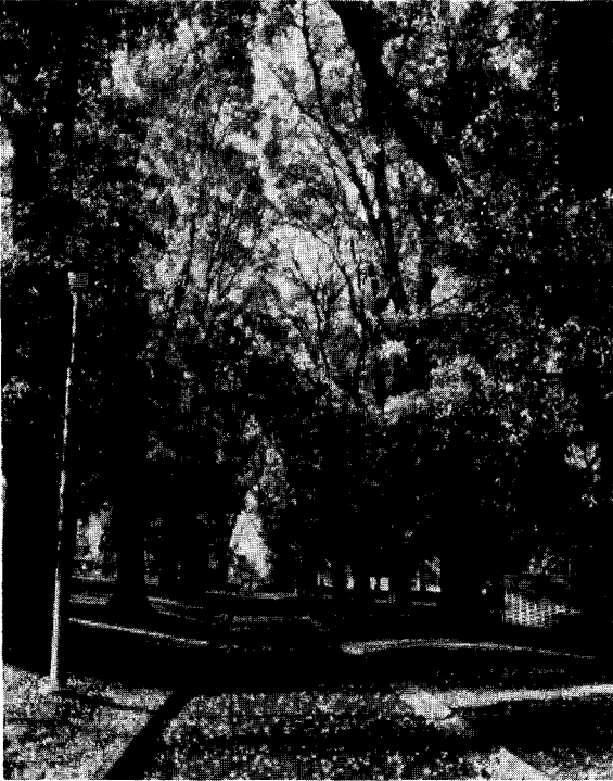
Figure 3. The city of Melbourne still has major parks, avenues and boulevards dominated by elms. Management practices of the past have increased the risks of major pests and diseases affecting the trees.

Impedance Ration Meter (PIRM) has also proved useful (2) and is a development from an earlier electrical device developed in the 1950's (5). There is a general perception that better diagnostic tools are required in a more sophisticated approach to tree care and maintenance.