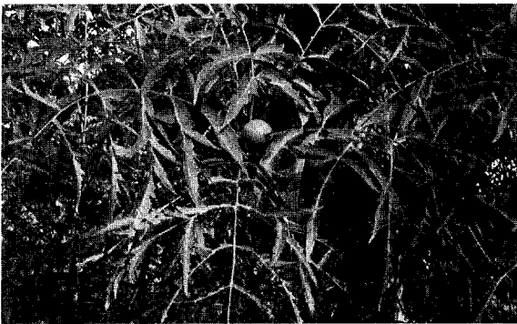
Fig. 4. Cut-leaf leaflets and fruit of Juglans regia 'Laciniata'.