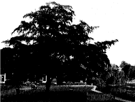
Fig. 6. Alnus glutinosa 'Imperialis' at Leamington Spa, England.