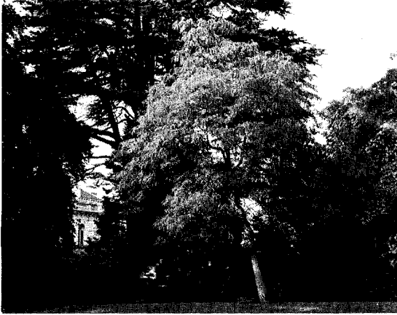
Fig. 3. Contrasting fine foliage of Juglans regia 'Laciniata'