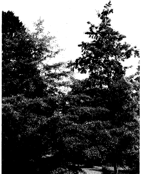
Fig. 5. The 'cut-leaf' alder, Alnus glutinosa 'Incisa', growing with the Italian alder, Alnus cordata at Batsford Park, England.