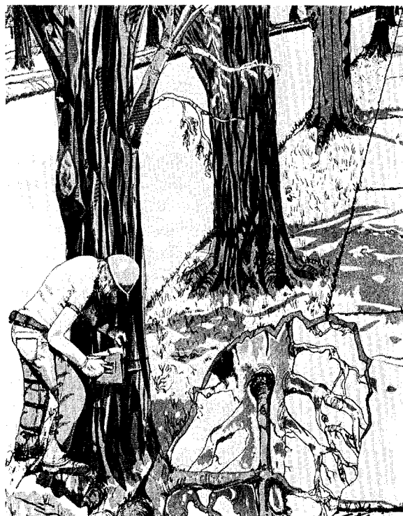
Fig. 1. A diseased elm being girdled to disrupt root-graft transmission of the fungus to adjacent elms.

which each diseased elm detected was immediately girdled and subsequently removed within 20 work days.