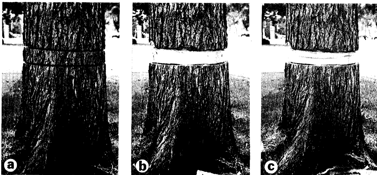
Fig. 2. Girdling process: (a) initial parallel cuts made with a chain saw to girdle a diseased elm, (b) sapwood removed from between the initial saw cuts, and (c) a third cut made into the wood to assure vessels are severed.

but not significantly less, than those sustained under the prompt-removal treatment. However, by the third year, 1976, a statistically significant difference was generated. If the experiment had ended in 1975, this improved performance would not have been detected. Only through Barger's conscientious, sustained effort were we able to realize that this strategy pays off by reducing elm losses. The beneficial effect of girdling, though insignificant at first, builds over time.