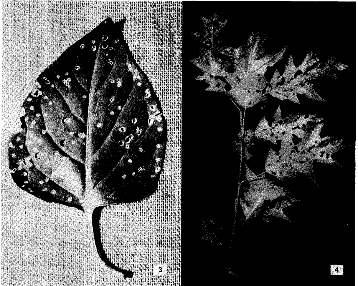
Figure 3-4. Fourlined plant bug damage on bitter nightshade (3) and agromyzid injury on red oak (4).

Careful inspection of ragged margins may help distinguished mined leaves from those damaged by chewing insects. Thin, browned, epidermal tissue with drops of fecal matter and necrotic areas where pinholes were originally made are evidence of leafmining activity. Unfortunately, these symptoms are so ephemeral that they are