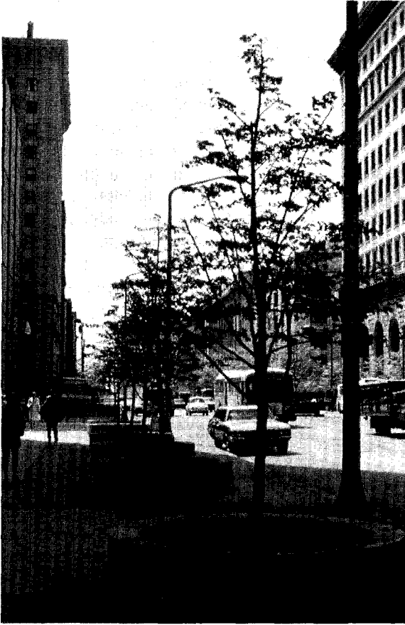
Fig. 1. The problems associated with moisture and temperature stress are frequently more pronounced when urban trees are grown in above-ground planters.

with water absorption and have a toxic effect on photosynthesis, respiration, protein synthesis and carbohydrate metabolism. Another important consideration in urban trees is the accumulation of potentially toxic concentrations of heavy metals such as mercury, lead and zinc.