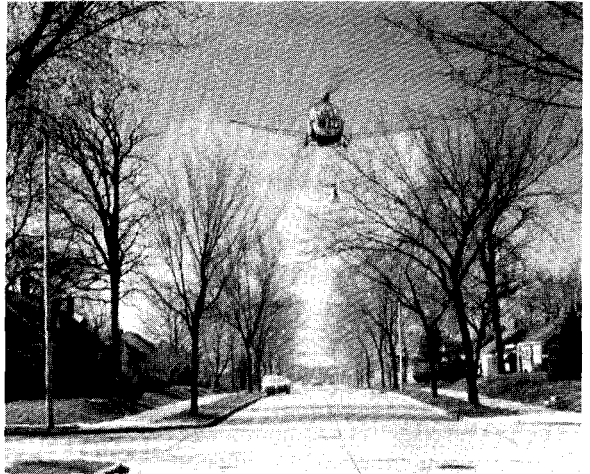
Fig. 2. Large-scale applications of chemical compounds for pest control and snow and ice removal make chemical stress an extremely important consideration in the urban environment.

Indiscriminate use of chemical compounds can significantly alter soil pH. Most tree roots grow over a considerable pH range, but reduced growth is often observed at pH values below 4.0. Changes in soil pH may indirectly influence tree growth as a result of differences in the solubility of inorganic nutrients as well as alterations in the activity of soil microorganisms responsible for nitrification.